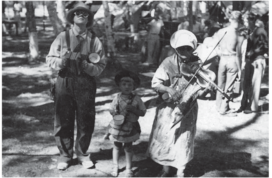
Wandering musicians at The Carnival in the 1930s