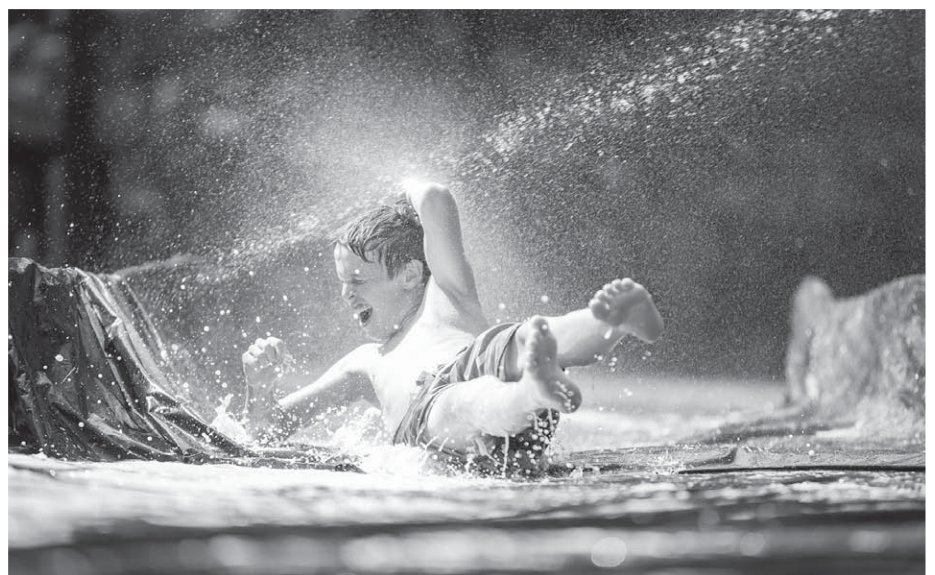
Slip 'n' Slide