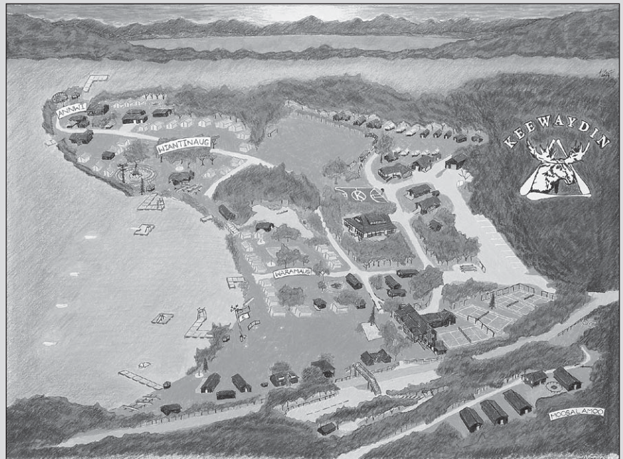
Original Dunmore Campus Map Illustration (in full color) by artist and staffman, Angus Barstow. Measures 16 x 12. Suitable for framing.

Visit our website at www.keewaydin.org , click on Camp Store and let the shopping begin!