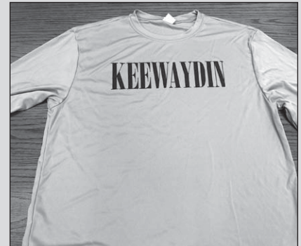
Keewaydin Tech Pullover