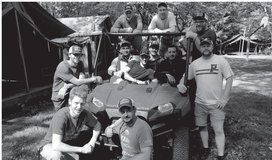
The few, the proud, the Keewaydin Work Crew!

The entire staff will arrive on June 15. The staff has a full week to prepare for the campers' arrival, including