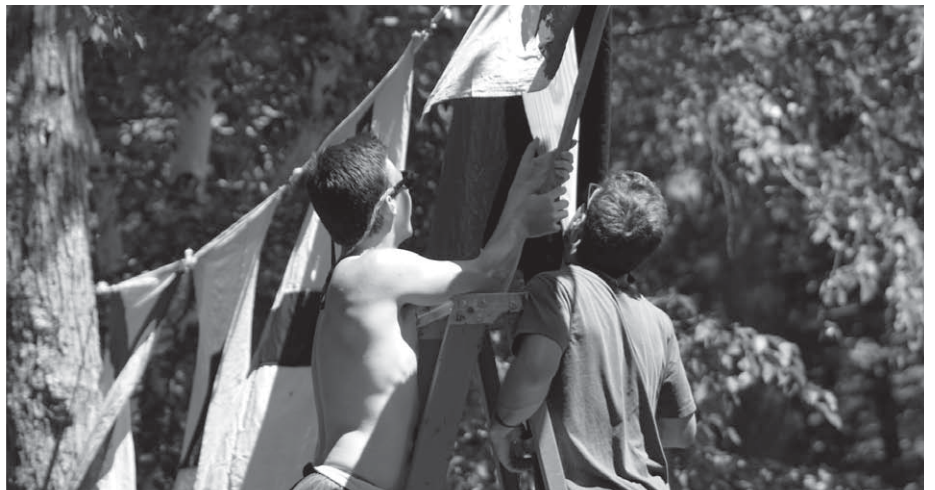
Carnival ritual: Flag set-up