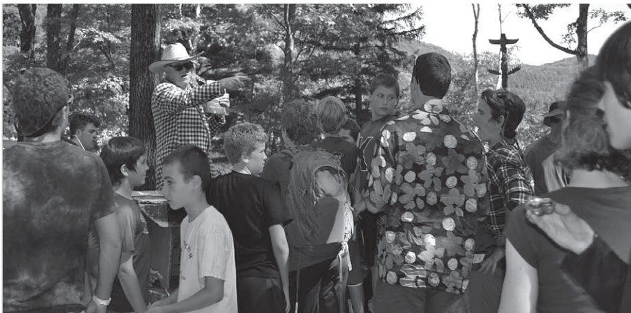
Red Dows' Auction

Of course, no Carnival would be complete without food concessions. We have rented popcorn, cotton candy and snow cone machines, but the best food concessions have been those which get ingredients from the Wangan Room or Kitchen and are prepared with the assistance of a “green box” (a.k.a Coleman stove). Onion rings, funnel cakes, pancakes, fried bananas and Oreos, sticky buns, and Spam fried rice have been served in great quantities over the years, delighting our taste buds and causing more than a few cases of indigestion. In the old days (i.e. pre-1994), every camper received a roll of pennies