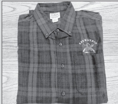
Keewaydin Flannel Shirt

Looking for a great gift? Look no further than The Keewaydin Store! The Keewaydin flannel shirt, tech pullover, and Dunmore Campus Map are all available now on our online store.