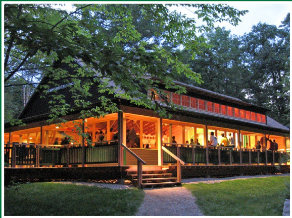
The Eisner Multi-House was completed in 2007

within just a few hours. But, also, he had a twinkle in his eye and you could see that he got real pleasure from being a part of “Keewaydin magic.” He will be missed, that is for sure.