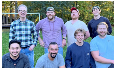
Fall Colors Good Ball Game