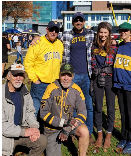
West Virginia football game reunion