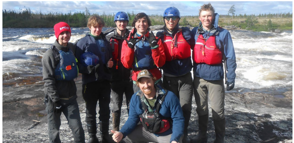
A record number of trippers will be going on Wilderness Trips this summer.