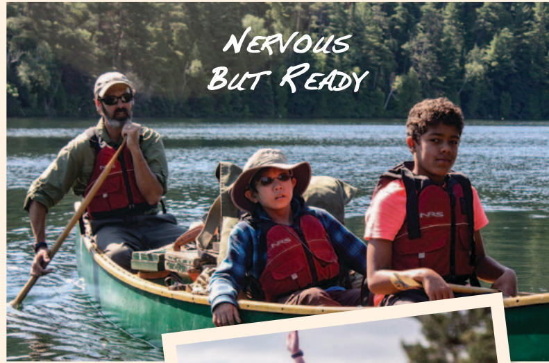
NERVOUS BUT READY