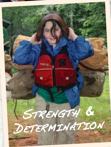
STRENGTH & DETERMINATION