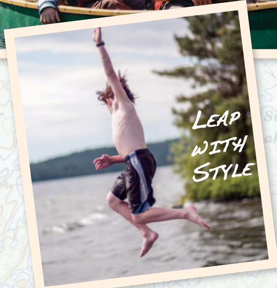
LEAP WITH STYLE